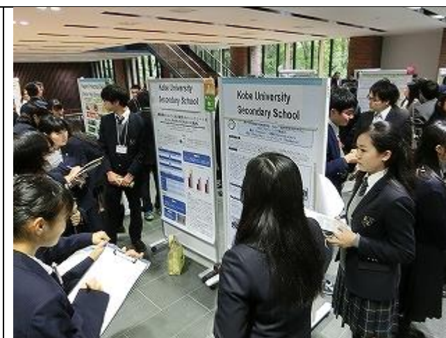
Our 6 th grade students and 4 th grade students from Sendai interaction team participated in this program.