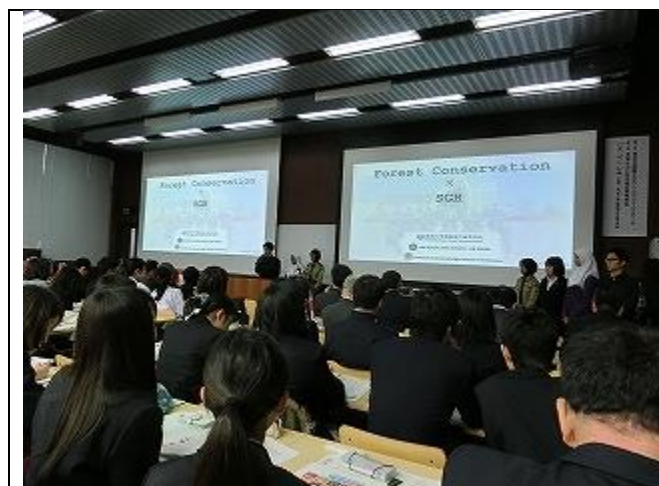
Activity reports from the SGH schools.